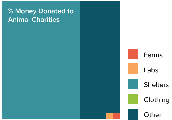
Annually in the United States

Animal suffering in our world is diverse and immense, but the magnitude of human-caused animal suffering inflicted on farmed animals dwarfs all other categories.